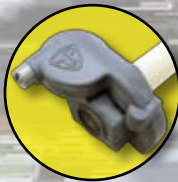
Vortex™ throttle 01-0054

Included: Rubber Mud Cover for Vortex Throttle