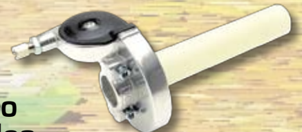
Turbo™ throttle 01-0057