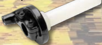
CR Pro™ throttle 01-0053