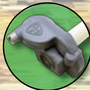
Vortex™ throttle 01-0054

Included: Rubber Mud Cover for Vortex Throttle