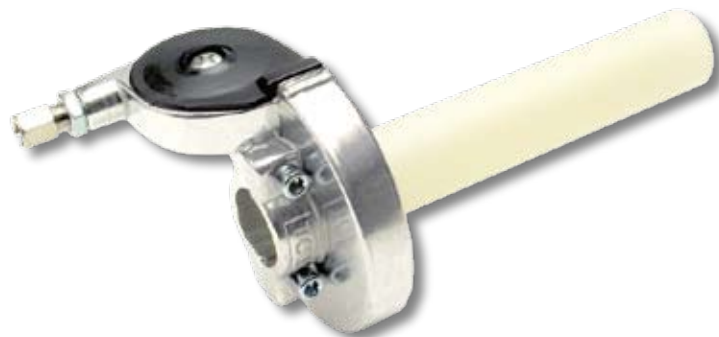
Turbo™ Throttle 01-0057