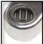
Roller bearing in clutch pivot