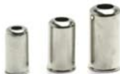
01-0004 (D) Cap Housing End 01-0005 (D) Cap Housing End 01-0006 (D) Cap Housing End