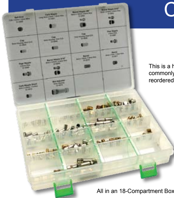
All in an 18-Compartment Box with label

This is a handy shop kit with the 14 of the most commonly used cable fittings. All fittings can be reordered as individual packets as listed below.