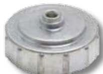
01-0023 Mikuni Cap